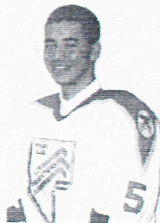
Ka to8etc nokom ka piponik